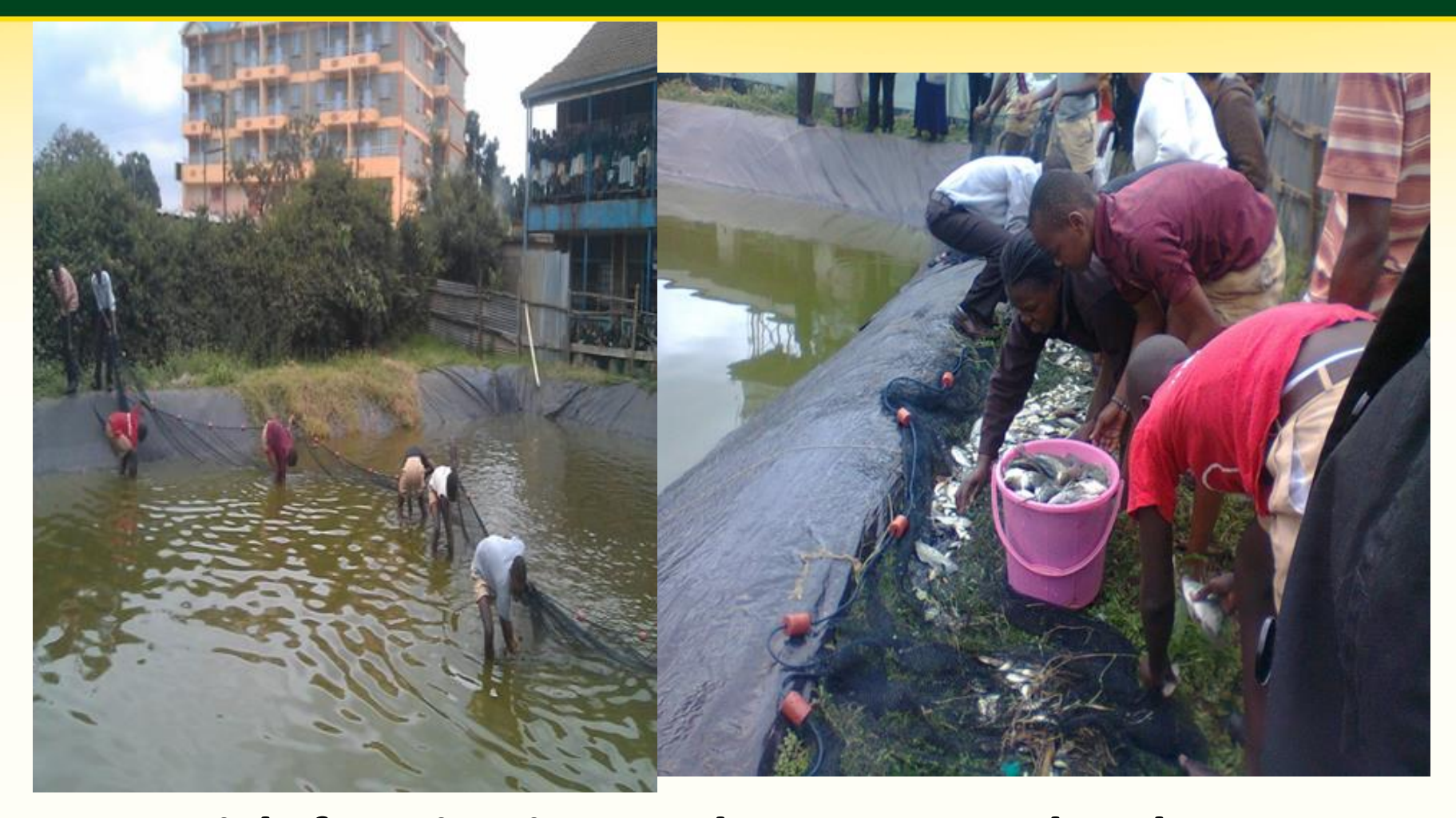
Fish farming in pond – Lenana school