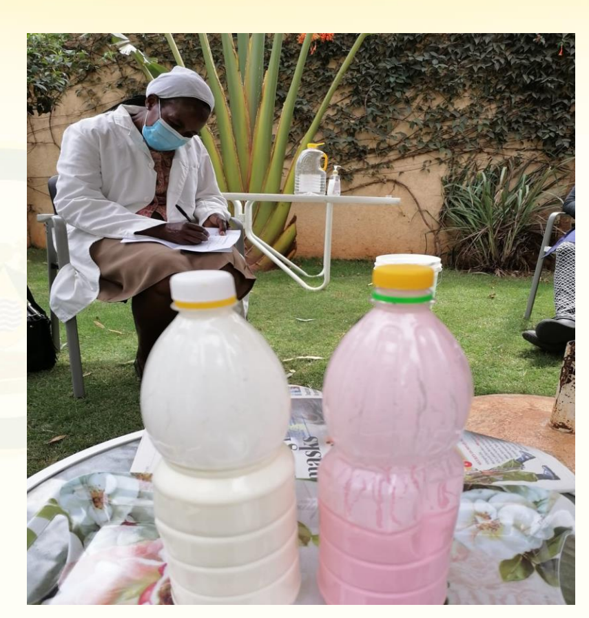
Milk value addition – Yoghurt making