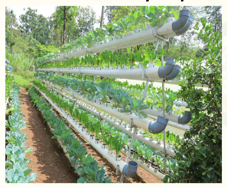
Olympic high school